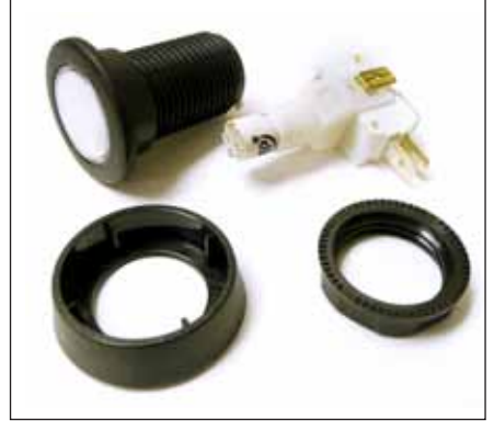
LOW PROFILE PUSHBUTTON PARTS: Button, removable bezel, tightening nut and switch with long-life LED cluster lamps